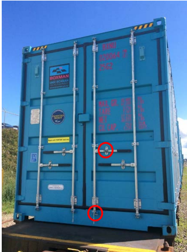
1 seal, in EITHER circled location is required

If required for load security and/or cleanliness, security seals should be applied immediately after closing.